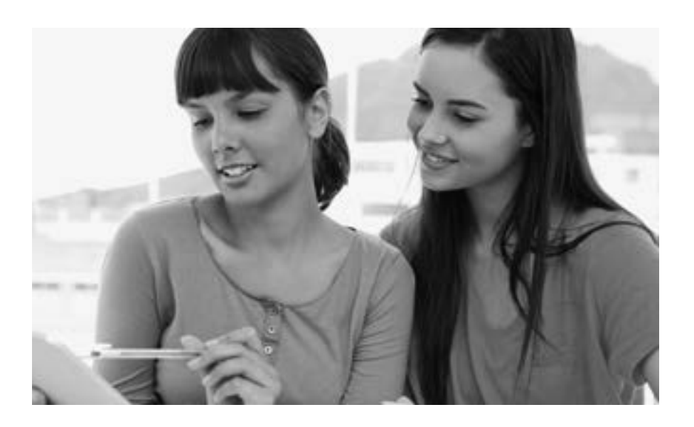
ADMISSIONS - UNDERGRADUATE PROGRAMS